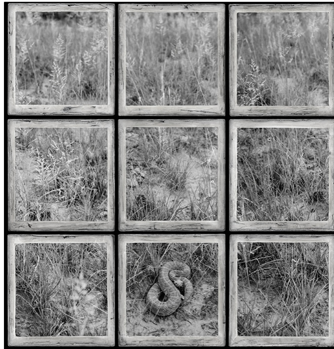
MICHAEL BERMAN, 96.s.84.04 Snake 9 plates , 2015 nine 5.5 x 5.75" plates, each a gelatin silver photo, pigment and acrylic on aluminum.

1405 Paseo de Peralta, Santa Fe, New Mexico 87501