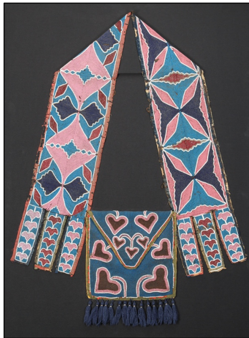
Delaware Bandelier Bag, 1840-1860, 31x23”