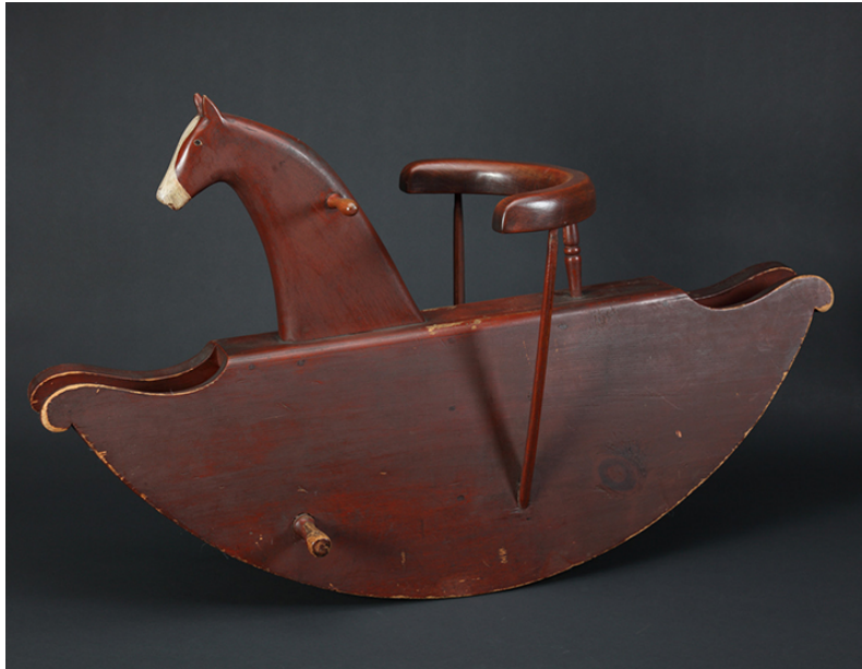
Pennsylvania Folk Art Rocking Horse, 1840-1870, 40.5 x 25.5"