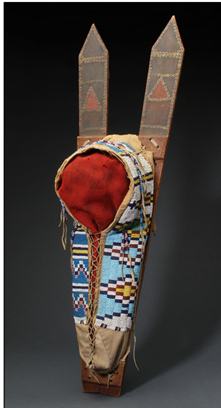
Southern Plains Bead-decorated Cradleboard, Kiowa or Comanche, circa 1870's 35 3/4 in. x 11 in. x 7 in

1405 Paseo de Peralta, Santa Fe, New Mexico 87501