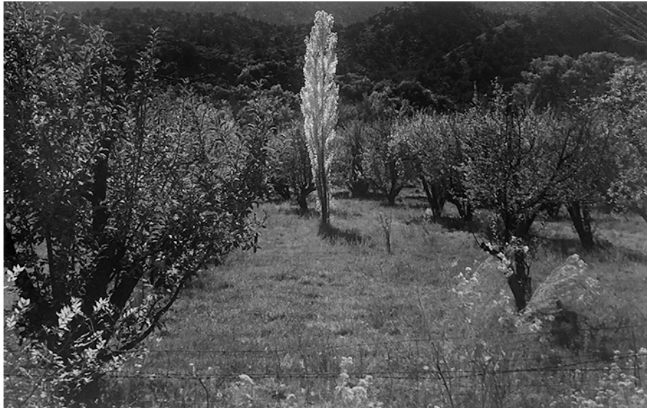
PAUL CAPONIGRO, Orchard, Dixon, New Mexico, 1975 , 8.75 x 13.5", gelatin silver print