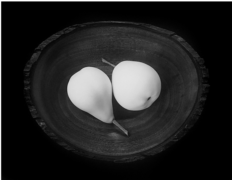
PAUL CAPONIGRO, Two Pears, Cushing, Maine, 1999 , 8.75 x 10.75", gelatin silver print

Paul Caponigro had his first solo exhibition at the George Eastman House in 1958 and his work has been shown in countless exhibitions throughout the United States and abroad. During the 1960's he was a part-time teacher at Boston University while consulting on various technical research projects with the Polaroid Corporation. He has received two Guggenheim Fellowships and three National Endowment for the Arts (NEA) grants. In recognition of a career spanning nearly seventy years, and a sustained, significant contribution to the art of photography, Caponigro was awarded The Royal Photographic Society's Centenary Medal and Honorary Fellowship in 2001.