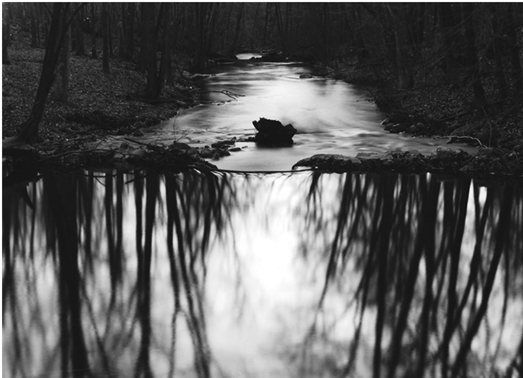
PAUL CAPONIGRO, Reflecting Stream, Redding, CT, 1968 , 13.5 x 18.75", gelatin silver print

1405 Paseo de Peralta, Santa Fe, New Mexico 87505 obscuragalleryphoto@gmail.com