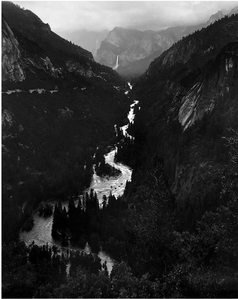
PAUL CAPONIGRO, Merced River, Yosemite, CA, 1975 , 12.5 X 9.75", gelatin silver print

1405 Paseo de Peralta, Santa Fe, New Mexico 87505 obscuragalleryphoto@gmail.com