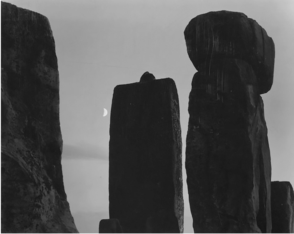
PAUL CAPONIGRO, Stonehenge with Moon, England, 1972 , 6.5 x 8.25", gelatin silver print