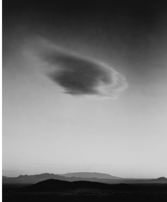
PAUL CAPONIGRO, Cloud, San Sebastian, Santa Fe, NM, 1980 , 13.5 x 10.5", gelatin silver print

Caponigro is best known for spiritual renditions that occur in natural forms, landscapes, and still lifes. His thirst for majestic subject matter has taken him to Stonehenge and other Celtic megaliths of England and Ireland; the temples, shrines and sacred gardens of Japan; the deep mystical woodlands of New England, and the coastal and grand landscapes of California. These subjects have culminated into over a dozen books by the artist published throughout the span of his career.