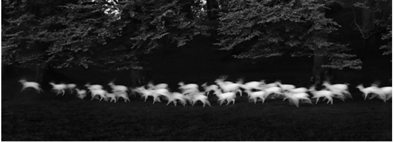
PAUL CAPONIGRO, Running White Deer, Wicklow, Ireland, 1967 , 9 x 23.75", gelatin silver print