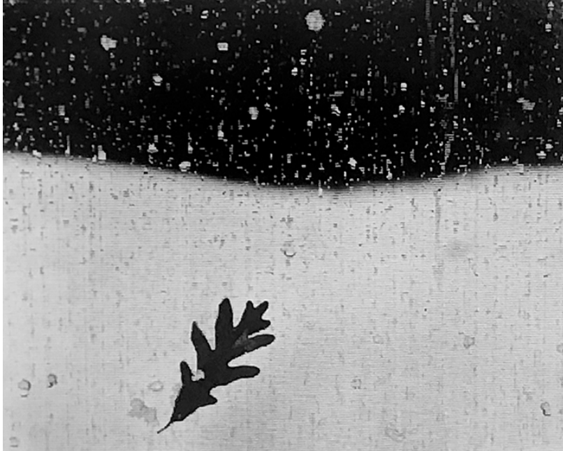
PAUL CAPONIGRO, Leaf on Wet Screen, Ipswich, MA, 1965 , 18 x 22", gelatin silver print

Paul Caponigro had his first solo exhibition at the George Eastman House in 1958 and his work has been shown in countless exhibitions throughout the United States and abroad. During the 1960's he was a part-time teacher at Boston University while consulting on various technical research projects with the Polaroid Corporation. He has received two Guggenheim Fellowships and three National Endowment for the Arts (NEA) grants. In recognition of a career spanning nearly seventy years, and a sustained, significant contribution to the art of photography, Caponigro was awarded The Royal Photographic Society's Centenary Medal and Honorary Fellowship in 2001.