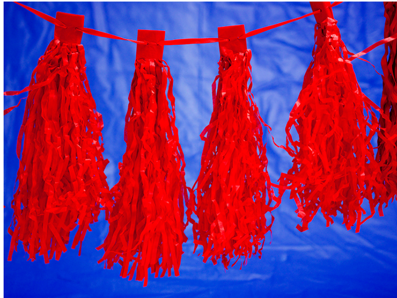
Jonathan Blaustein, Red streamers and blue plastic tablecloth , 2017, 9 x12", Dye sublimation on aluminum, mounted to a hollow, 2" white wood block. Edition of 5.

As the world grapples with the impact of climate change in the 21st Century, Blaustein's art presents a deconstructed view of the manner in which humans churn up the planet's resources for profit. Whether photographing food from around the world, nature harvested on his property outside Taos, NM, years worth of accumulated junk in his former studio, or party supplies from the megacorporation Party City, the consistent message is that we're eating away at our home planet, at considerable peril to all its existing species.