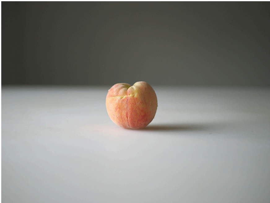
Jonathan Blaustein, One dollar's worth of local peach from the farmer's market , 2013, 30 x 40", Archival ultrachrome print, mounted to aluminum and laminated, then framed. Edition 1 of 3