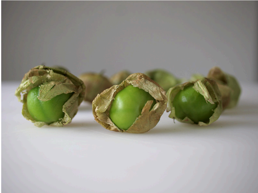
Jonathan Blaustein, One dollar's worth of tomatillos from Mexico , 2008, 30 x 40", Archival ultrachrome prints, mounted, laminated and framed. Edition of 3