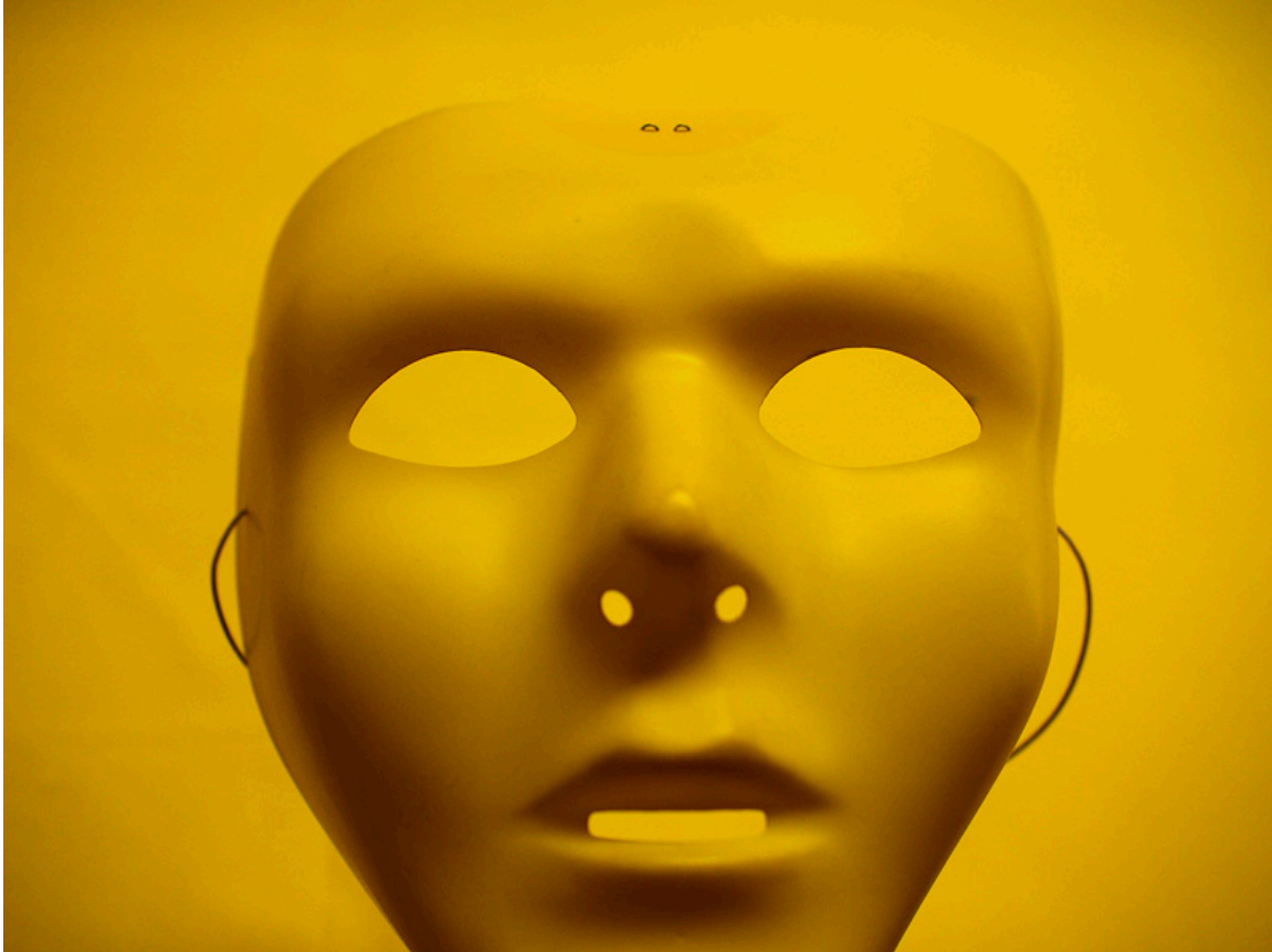
Jonathan Blaustein, Yellow mask and yellow plastic tablecloth , 2017, 9 x12", Dye sublimation on aluminum, mounted to a hollow, 2" white wood block. Edition of 5.

Yoffy Press is an independent publisher dedicated to pushing the boundaries of photobook publishing. Working in true partnership with artists, we look beyond the book as a container of images, integrating physical and conceptual design to create distinct art objects.