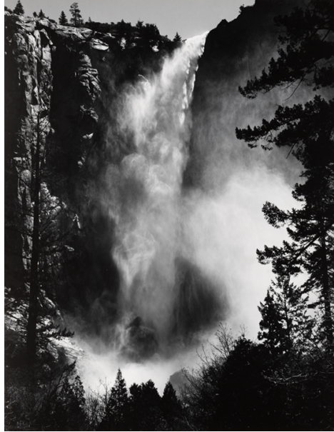
Ansel Adams, Bridalveil Fall, Yosemite . c. 1927. 9 1/4 x 7 1/4", gelatin silver print.