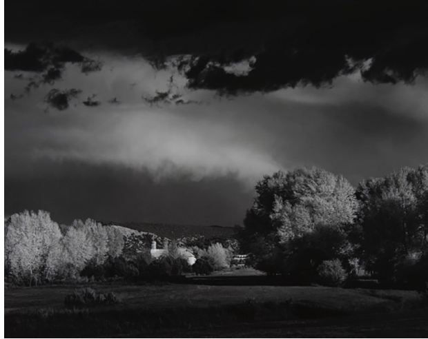
Ansel Adams, Autumn Storm, Las Trampas, Near Penasco, NM, 1958 , 15.5 x 19.5", gelatin silver print.

For high resolution files and more information please contact: