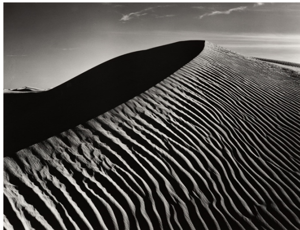
Ansel Adams, White Sands National Monument , c. 1942, 7 x 9 1/4", gelatin silver print.