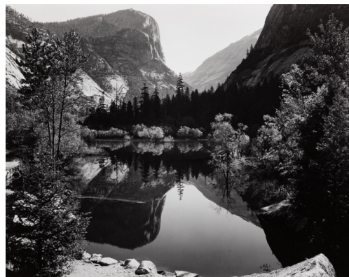
Ansel Adams, Mirror Lake, Yosemite , 1935, 7 3/4 x 9 7/8", gelatin silver print.