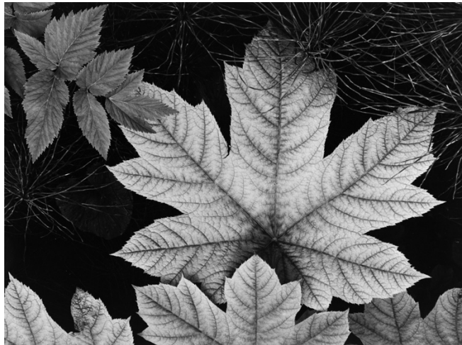
Ansel Adams, Leaf, Glacier Bay, Alaska, 1948 , 7 3/4 x 10 3/8", gelatin silver print.