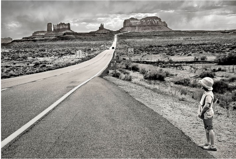
Joan Myers, Monument Valley, UT, 2021, 20 x 30", archival pigment ink print, edition of 10.