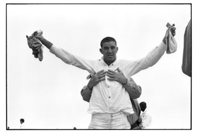
DANNY LYON, Shakedown, Ellis Unit, Texas, 1968, 12.5 x 18.5", gelatin silver print.

Many of Lyon's portraits are based on the complex stories of the portrayed individuals. He spent time getting to know the people he photographed, hearing their stories and their struggles, and often maintaining friendships for many years. Lyon spent two years documenting the treatment of inmates in the Texas penitentiary system. Photographs of prisoners on chain gangs working in the fields, unconscious from heat exhaustion, and stripped bare for shakedown searches all present pointed commentary on mass incarceration photographing the Texas prison system.