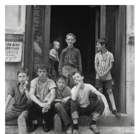
DANNY LYON, Uptown, Chicago, 1965, 7 x 7", gelatin silver print.

Danny Lyon is internationally recognized as a major force in establishing new models for both documentary photography and the photography book. He has won numerous honors and awards in both photography and film, including Guggenheim Fellowships in both film and photography, and the 2015 Lucie Award for Achievement in Documentary Photography. Over the course of his career, he has published more than 20 books of photography and has been the subject of over fifty solo exhibitions. Lyon's work is in the permanent collections of The Museum of Modern Art, The Metropolitan Museum of Art, the Whitney Museum of American Art, the Art Institute of Chicago, American Museum of Art, Smithsonian Institute, the J. Paul Getty Museum, and many other public institutions.