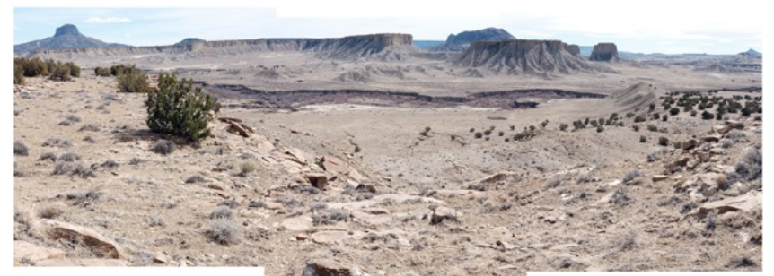
DANNY LYON, The Rio Puerco Seen from South of Cabezon, New Mexico, 2019, 6.25 x 18", archival pigment ink print.

Lyon's more recent work explores southwest landscapes and the environment, documenting the impacts of extreme drought and fire on the land. Bleak but beautiful scenes of burnt forests show our new climate reality. Montages portray the vastness of the southwest landscape and the passage of geological time.