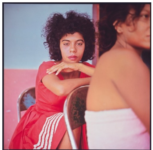
DANNY LYON, Tesca, Cartagena, Colombia, 1966, 10 x 10", Cibachrome.

Danny Lyon is internationally recognized as a major force in establishing new models for both documentary photography and the photography book. He has won numerous honors and awards in both photography and film, including Guggenheim Fellowships in both film and photography, and the 2015 Lucie Award for Achievement in Documentary Photography. Over the course of his career, he has published more than 20 books of photography and has been the subject of over fifty solo exhibitions. Lyon's work is in the permanent collections of The Museum of Modern Art, The Metropolitan Museum of Art, the Whitney Museum of American Art, the Art Institute of Chicago, American Museum of Art, Smithsonian Institute, the J. Paul Getty Museum, and many other public institutions.