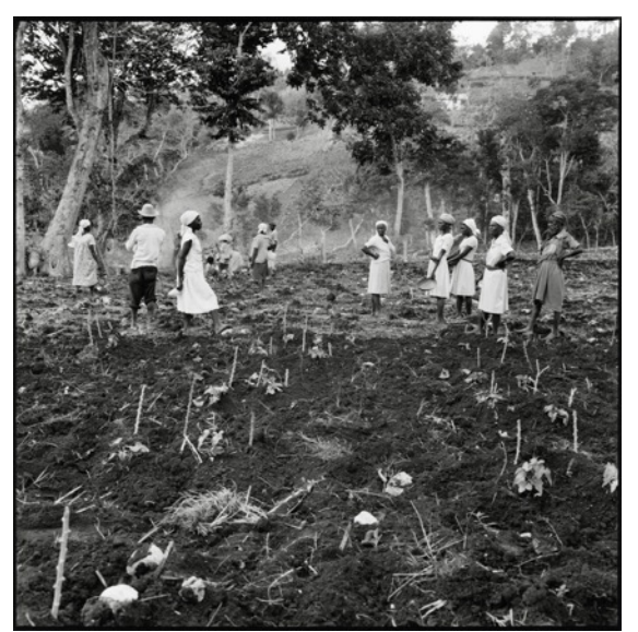
DANNY LYON, Women Wait to Plant a Field above Jacmel, Haiti, 1983, 15 x 15", gelatin silver print.

Many of Lyon's portraits are based on the complex stories of the portrayed individuals. He spent time getting to know the people he photographed, hearing their stories and their struggles, and often maintaining friendships for many years. Lyon spent two years documenting the treatment of inmates in the Texas penitentiary system. Photographs of prisoners on chain gangs working in the fields, unconscious from heat exhaustion, and stripped bare for shakedown searches all present pointed commentary on mass incarceration photographing the Texas prison system.