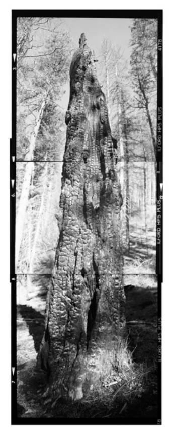
DANNY LYON. Remains of a ponderosa pine destroyed in the Los Conchas fire, New Mexico. 2014, 40.25 x 14.75", gelatin silver print.

Lyon's more recent work explores southwest landscapes and the environment, documenting the impacts of extreme drought and fire on the land. Bleak but beautiful scenes of burnt forests show our new climate reality. Montages portray the vastness of the southwest landscape and the passage of geological time.