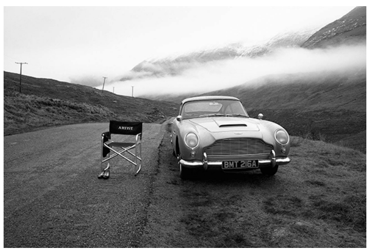
ROGER DEAKINS, Judis chair, Scotland, 2012

Included in the Obscura Gallery exhibition are a selection of images from the monograph Byways, now in its seventh reprint, which includes over 150 previously unpublished black-and-white photographs spanning five decades, from 1971 to the present. After graduating from college Deakins spent a year photographing life in rural North Devon, in South West England, on a commission for the Beaford Arts Centre; these images are gathered here for the first time and attest to a keenly ironic English sensibility, also documenting a vanished postwar Britain. A second suite of images expresses Deakins' love of the seaside. Traveling for his cinematic work has allowed Deakins to photograph landscapes all over the world; in this third group of images, that same irony remains evident. There are several images in the exhibition taken in our home-state of New Mexico with the same character and signature style of which Deakins is revered.