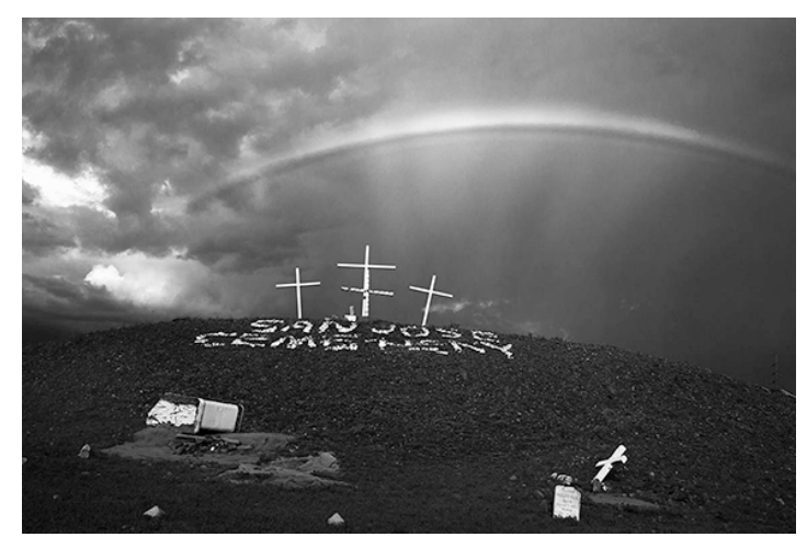
ROGER DEAKINS. The passing storm, Albuquerque, 2014

Included in the Obscura Gallery exhibition are a selection of images from the monograph Byways, now in its seventh reprint, which includes over 150 previously unpublished black-and-white photographs spanning five decades, from 1971 to the present. After graduating from college Deakins spent a year photographing life in rural North Devon, in South West England, on a commission for the Beaford Arts Centre; these images are gathered here for the first time and attest to a keenly ironic English sensibility, also documenting a vanished postwar Britain. A second suite of images expresses Deakins' love of the seaside. Traveling for his cinematic work has allowed Deakins to photograph landscapes all over the world; in this third group of images, that same irony remains evident. There are several images in the exhibition taken in our home-state of New Mexico with the same character and signature style of which Deakins is revered.